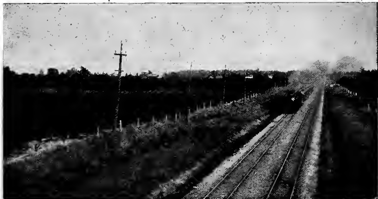
THROUGH THE GARDEN OF CANADA.

Write to the undersigned for descriptive literature.